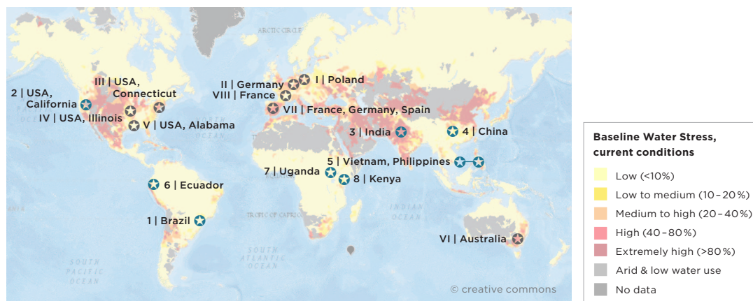
Table 1: Selected examples for water-induced cuts in hydro (★ in Figure 1), coal and nuclear (both ☆ in Figure 1) power generation.