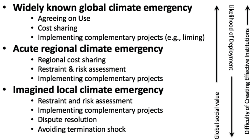
Figure 1: Stylized Deployment Scenarios for Solar Geoengineering

For too long, the discussion of geoengineering governance has involved too much imagination about governing institutions and not enough attention to the incentives for countries to build such institutions. A focus on incentives may suggest that it will be impossible to gain truly global support for institutions that can effectively restrain unilateral geoengineering. But it also suggests that there could be very powerful incentives for countries to create something different: a club that prepares responses to unilateral geoengineering. An ideal world institution for global governance of geoengineering may be tempting to envision, but this outcome is unlikely. A “blade runner” world of countries working together to counter rogue geoengineers presents a darker picture, but is perhaps more probable and therefore a more useful basis for practical discussions of governance.