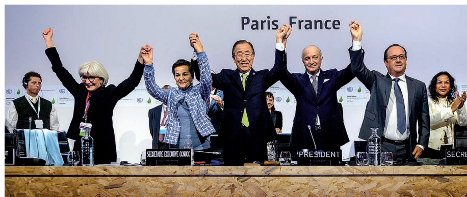
Achieving ambitious global temperature goals appears increasingly implausible, but the Paris Agreement, agreed in 2015, nevertheless offers hope by promising a more democratic climate politics.

Several proposed CDR techniques may eventually be capable of removing several hundred gigatons of CO 2 by the end of this