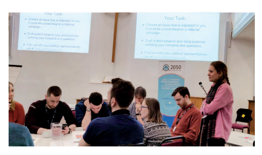
A workshop of the 2050 Climate Group to empower young people to engage with political processes around climate change

Deliberative citizen participation processes, ranging in scale from topic-focused mini-publics to national citizens' assemblies can also facilitate consensus building and longer-term thinking. Outcomes, decisions or ideas that emerge from such processes could contribute to decision-making with concrete recommendations, binding proposals for government, or other contextually relevant outputs. They could address specific questions or topics, or a broader vision of the future. Furthermore, accurately representing demographics, including young people and future generations, is crucial to the success and legitimacy of such processes.