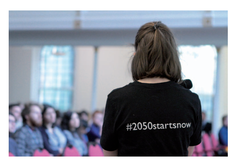
A youth volunteer facilitating a co-design session on imagining a low-carbon future with over 100 young people in Scotland.

This Futuring Tool contains a list of possibilities, including future impact and assessment tools; participatory future-making processes; specialised councils within government with diverse representation; deliberative citizen participation processes; techniques to integrate concern for future generations into existing institutional remits and processes; and reforms of metrics and indicators for progress. Three core ideas on integration, participation and imagination emerged from this process and are the main discussion points of this policy brief.