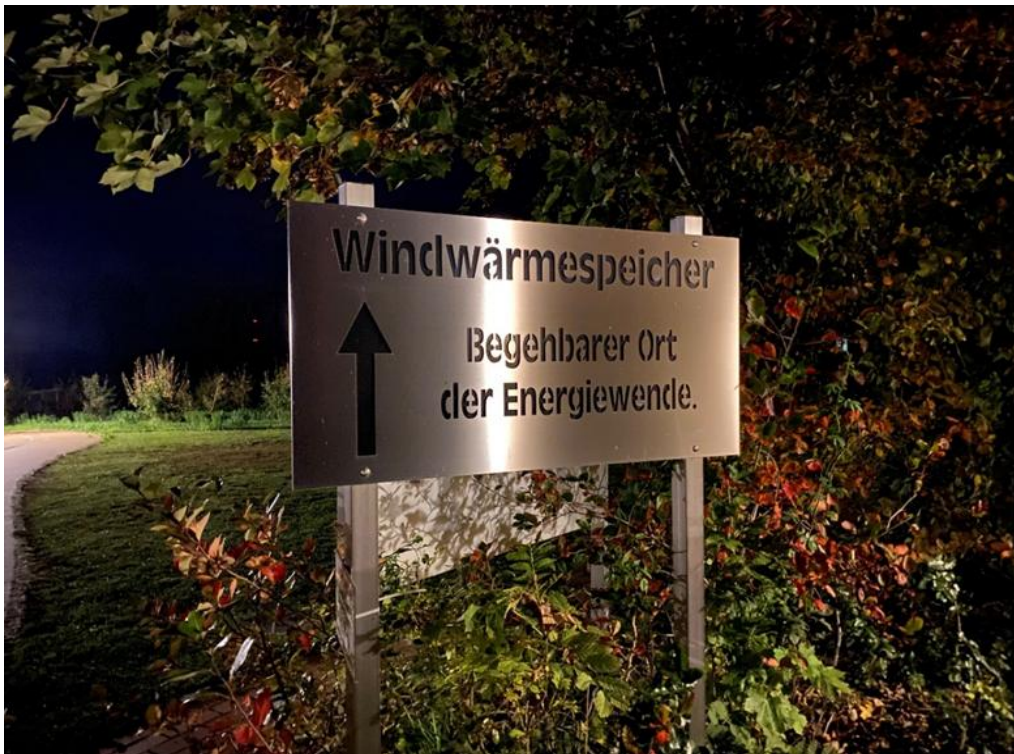
THE ENTRANCE TO THE THERMAL ENERGY STORAGE FACILITY IN NECHLIN.